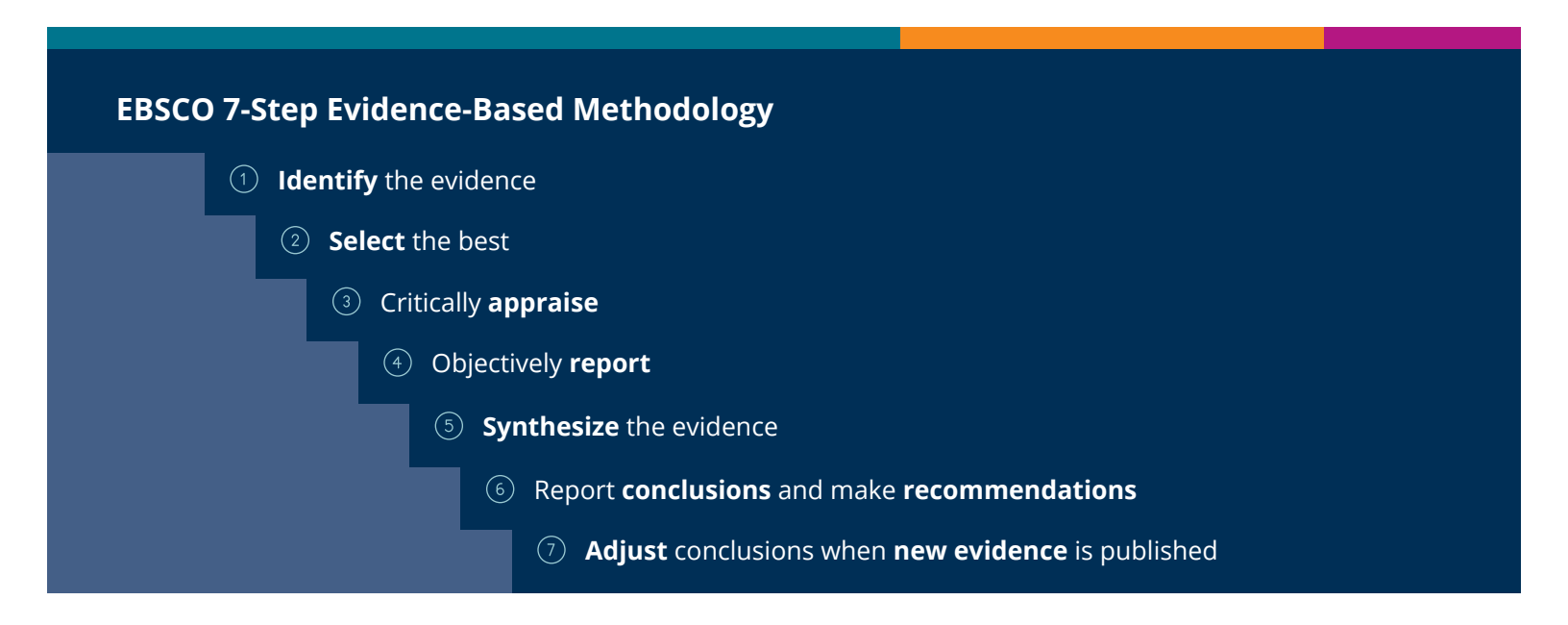
Figure 3: *EBSCO 7-Step Evidence-Based Methodology

The EBSCO clinical resources highlighted in Table 1 follow EBSCO's 7-Step Evidence-Based Methodology.